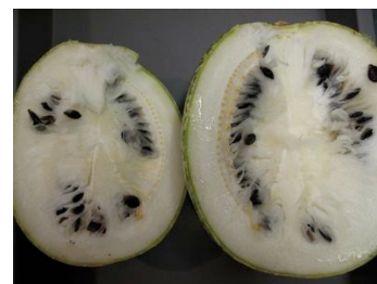
Sharks fin melon – a savoury melon used in soups by the Chinese

If you are part of a community group, allotment or growing group you can come along and receive free training, resources and seed for growing and preparing new and exciting food