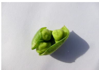
Green chick peas from India roasted in their shells